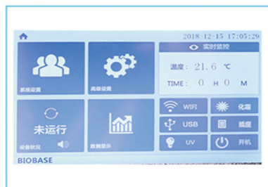
LCD touch screen